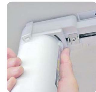
SIMPLE TO INSTALL WITH BUILT-IN SAFETY LOCK