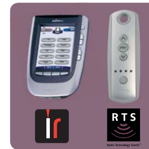
COMPATIBLE WITH ALL TYPES OF CONTROL SYSTEMS