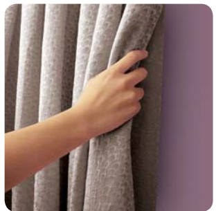
MANUAL OPERATION POSSIBLE WITHOUT DAMAGING THE CURTAINS