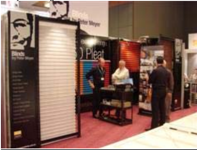
Our stand at BMAA